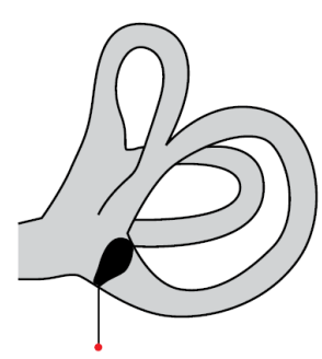
Sensitive part of the canal

There is a collection of tiny crystals inside your ear. They have a valuable role to play when sitting in the correct position. BPPV occurs when the crystals are dislodged from their correct position. They move into one or more of the semi-circular canals and either continue to float around or become attached to another part of the ear.